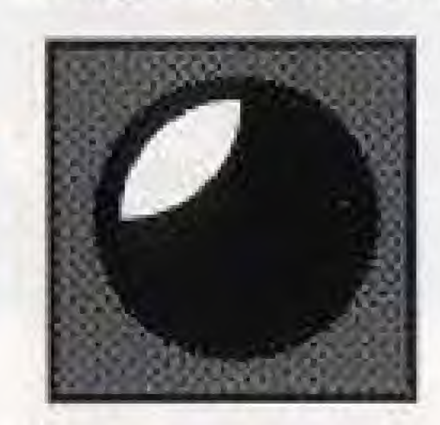
RED SPHERE Restores one LIFE square